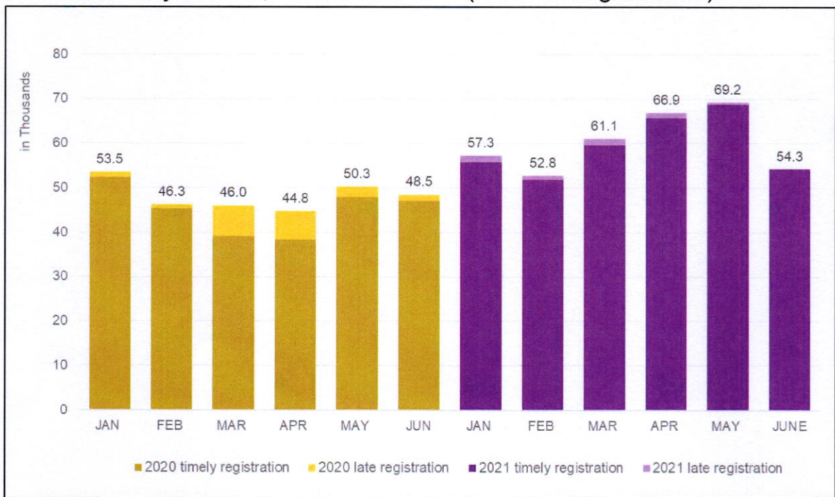
Figure 1. Number of Registered Deaths in the Philippines January to June, 2020 and 2021 (P) (as of 12 August 2021)