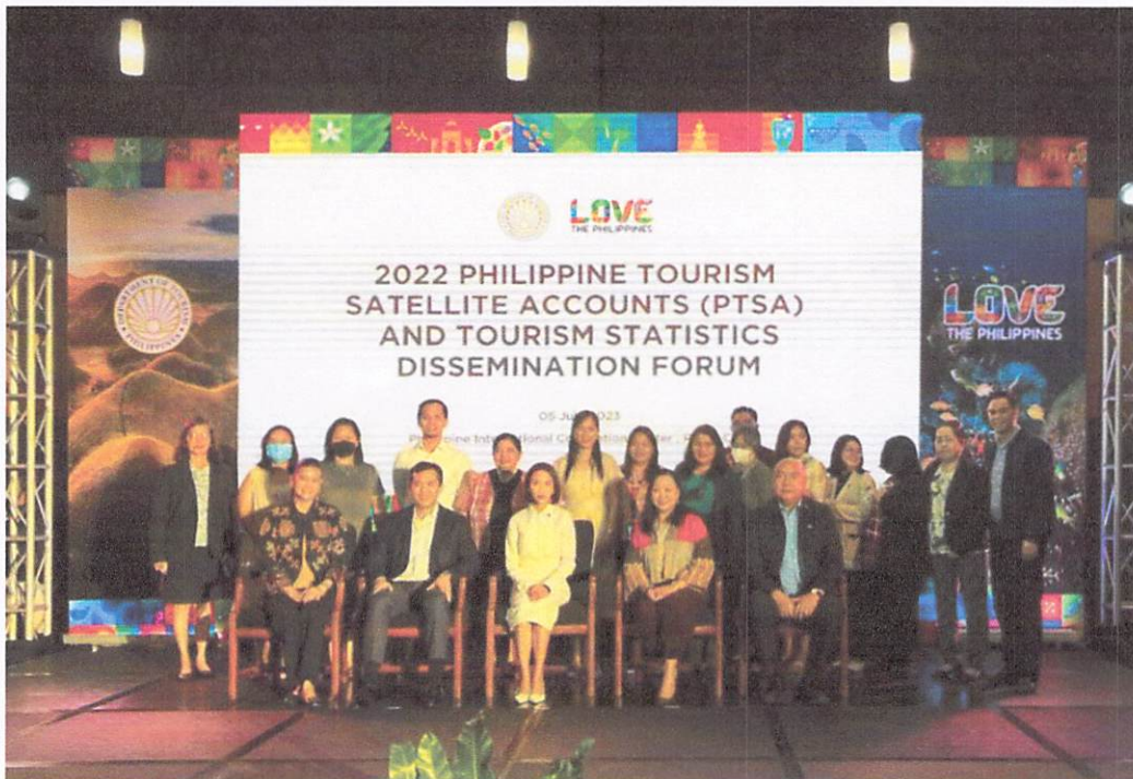
DOT and PSA officials and staff posed for a photo during the 2022 PTSA and Tourism Statistics Dissemination Forum

The Philippine Statistics Authority (PSA) and the Department of Tourism (DOT) jointly conducted the 2022 Philippine Tourism Satellite Accounts (PTSA) and Tourism Statistics Dissemination Forum on 05 July 2023 at the Philippine International Convention Center in Pasay City. The event was participated by officials and representatives from various government agencies, regional tourism offices, tourism stakeholders, academe, and media. The forum served as a platform to present the contribution of tourism to the economy and the tourism statistics reports. It also served as a venue for stakeholders to appreciate the value and importance of tourism data and statistics.