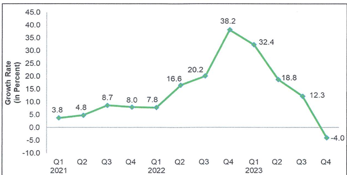
Figure 2. Year-on-Year Growth Rates of PPI for Crops, Philippines First Quarter 2021 to Fourth Quarter 2023 (2018=100)

Note: First Quarter to Fourth Quarter 2023 are preliminary.