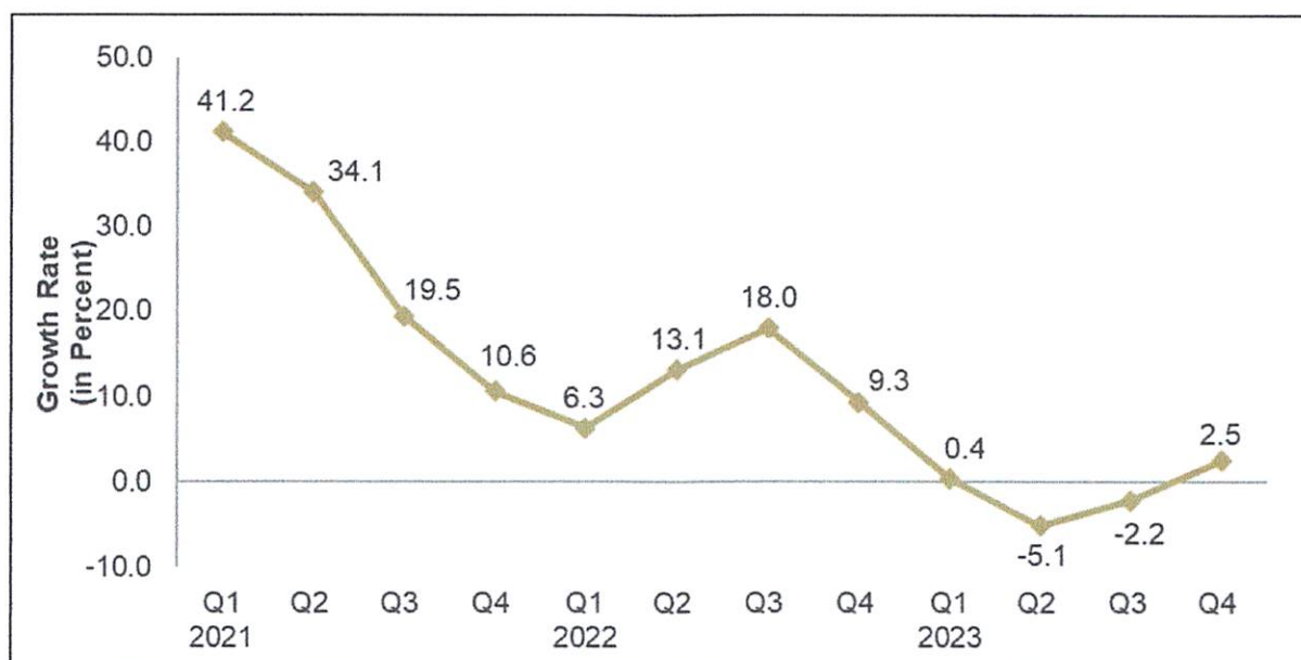
Figure 3. Year-on-Year Growth Rates of PPI for Livestock and Poultry Philippines: First Quarter 2021 to Fourth Quarter 2023 (2018=100)

Note: First Quarter to Fourth Quarter 2023 are preliminary. Source: Philippine Statistics Authority