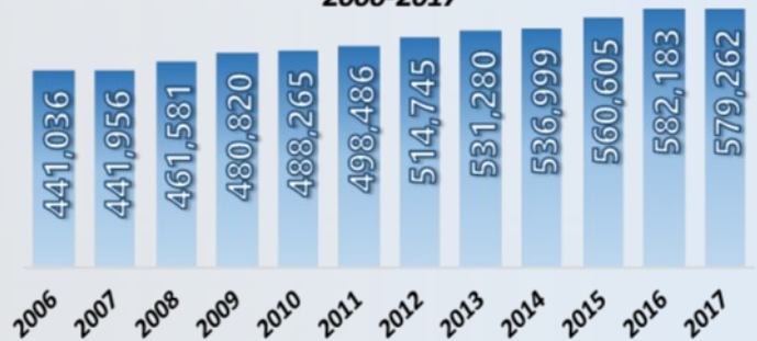
Annual Number of Registered Deaths: 2006-2017