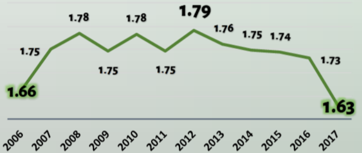
Annual Number of Registered Live Births, in Millions: 2006-2017